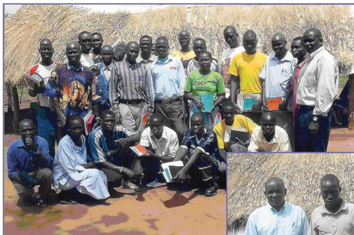
(Above) Participants and preachers who attended the training sessions.

Those who attended were leaders and preachers from eight congregations in South Sudan and six congregations in Uganda. The churches in Uganda are from the same tribe, speak the same language and are located near the South Sudan border.