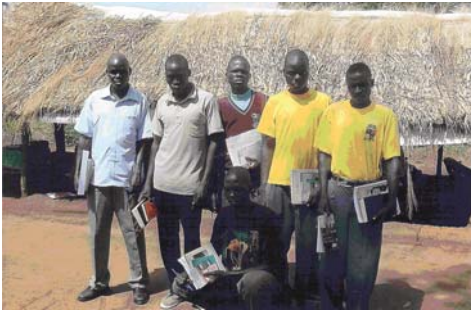
These six brethren rode bicycles six hours each way from Uganda to attend the training sessions.

Obbo church prepared three meals a day for everyone. Facilities were very limited as there were no kitchens, no tables, no electricity, and no running water! The closest water was a river a quarter mile away. It rained every day, which made it very difficult for the ladies to do this work.