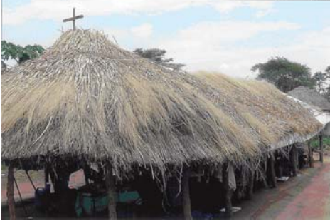
The Obbo congregation's building where the leadership training occurred.

This is the shelter where the workshop was held as well as the meeting place for the Obbo church. The church has about 70 members, and almost all of them came from churches that formerly met in the refugee camps in Uganda.