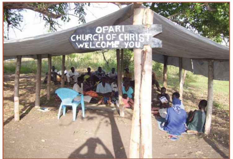
The meeting place with sign all ready for the church to begin.