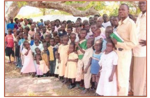
Part of the crowd on the first Sunday of the beginning of the Opari church.